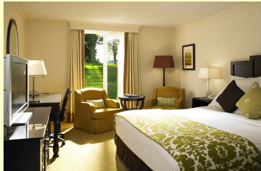
De Luxe Accommodation