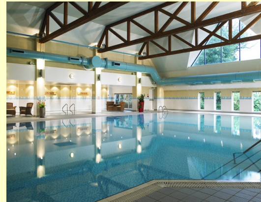
Spa of Senses

Swimming Pool, Sauna, Steam Room, Spa, Extensive Gym Equipment, along with 3 activity sites in the grounds