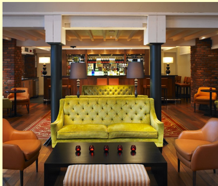
The Chimney Bar & Lounge