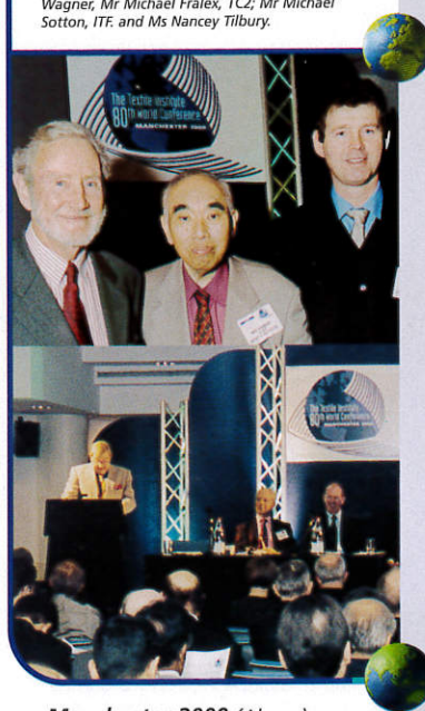
Manchester 2000 (Above)