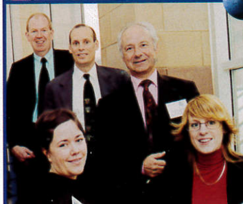
A Step in the Right Direction Before the Tuesday Plenary Sessions at Manchester 2000. (Above)