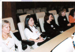
Young delegates who attended with support from the Textile Institute Benevolent Society