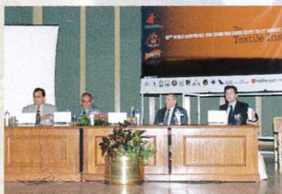
The speaker's table