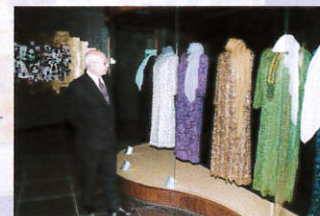
A delegate examines a display of local fashion dresses