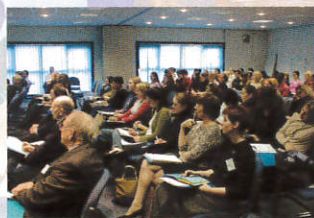
Delegates to the "Introduction to Textiles" conference