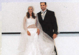
One of the highlights of the fashion show at The Annual World Conference, Cairo 2002